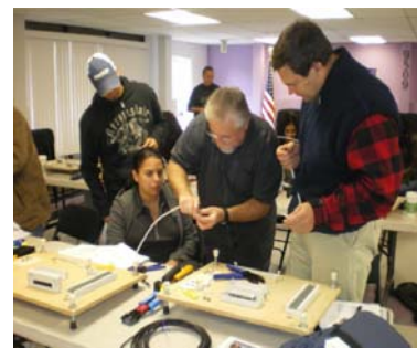
"This is how you terminate a COAX cable"

"At APT, we are motivated to giving something back. We are Telecom and our motivation is you"