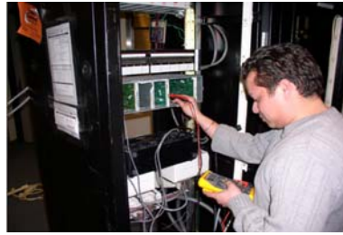
How about a little APT lab work?

For starters, we are not just a training vendor, we are a school...a real honest-to-goodness school. Being a real school means we aren’t just affiliated with a real school using their accreditation...we